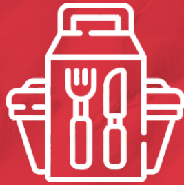
Pack Food Services